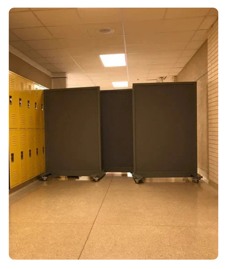
PROTECTED HALLWAY EXAMPLE