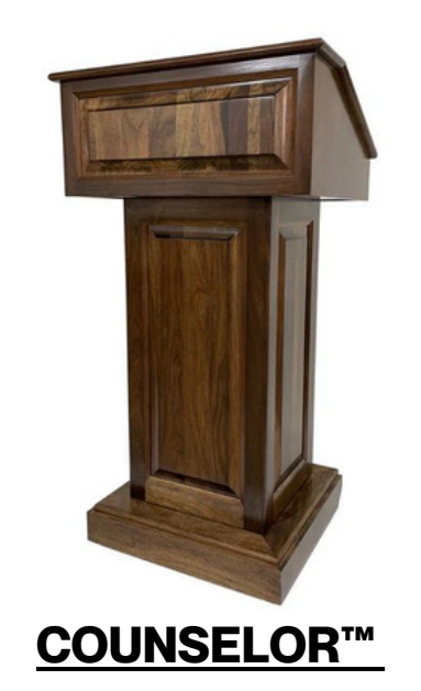
$2,195.00 - $2,995.00