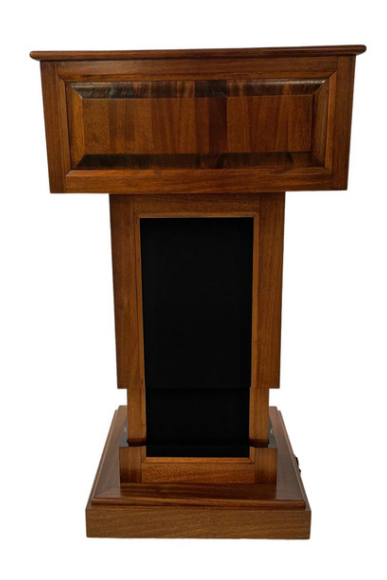
COUNSELOR™ EVOLUTION LIFT