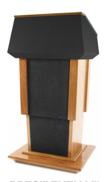
PRESIDENTIAL™ EVOLUTION LIFT