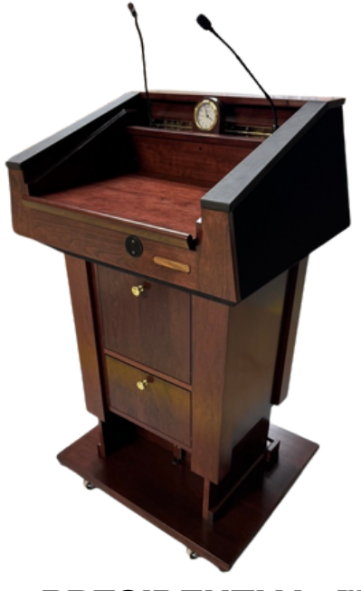
PRESIDENTIAL+™ EVOLUTION LIFT