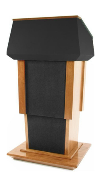
PRESIDENTIAL™ EVOLUTION LIFT