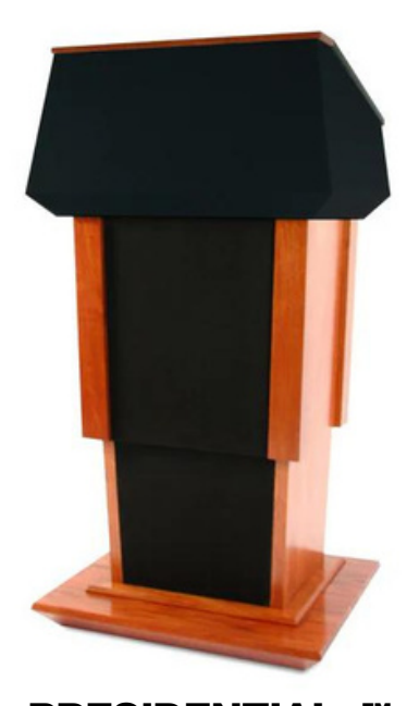
PRESIDENTIAL+™ EVOLUTION LIFT