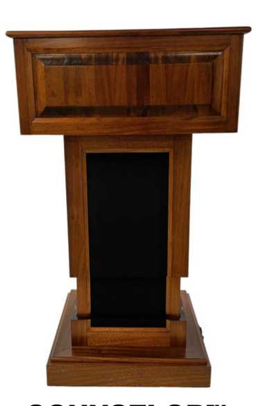
COUNSELOR™ EVOLUTION LIFT