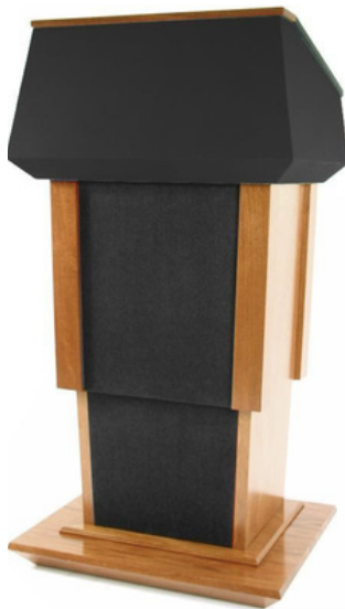
PRESIDENTIAL™ EVOLUTION LIFT