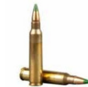
5.56mm FMJ, M855 "Green Tip" partial steel core ammunition

component to the hard armor plate to stop it. Some Level III have a ceramic/metallic face, but not all. If you have identified the M855 or other similarly designed steel core ammunition as a potential threat,