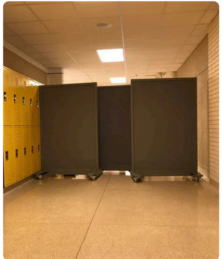
PROTECTED HALLWAY EXAMPLE