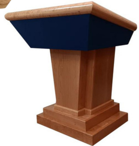
TITAN™ LIFT LECTERN