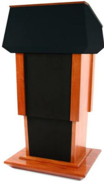
PRESIDENTIAL+™ EVOLUTION LIFT