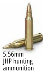
5.56mm JHP hunting ammunition

5.56mm ammunition comes in a wide variety of constructions. The rounds with lead cores typically used for hunting and target shooting can be stopped with Level III hard armor plates.