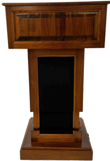
COUNSELOR™ EVOLUTION LIFT