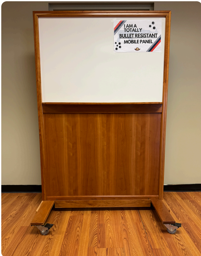
TACTICAL SCHOLAR™ WHITEBOARD