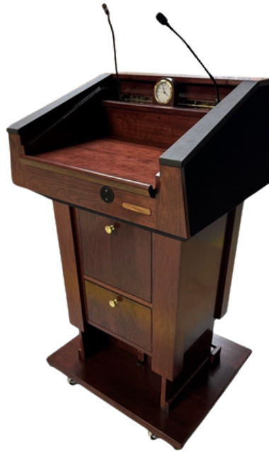
PRESIDENTIAL+™ EVOLUTION LIFT